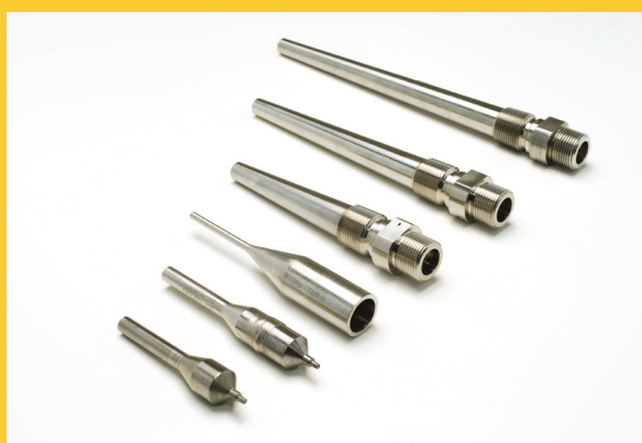
Fittings Adaptor & Thermowells