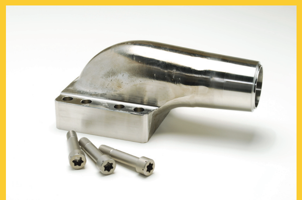
Feeder Connection Forged Flange Elbow and Cap Screw (ACR-1000)