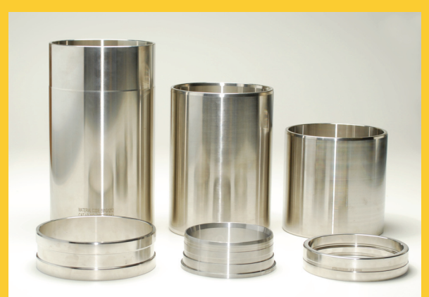
Fuel Channel - End Fitting Sleeves, Journal Rings and Calandria Tube Insert

Contact: Harshad Patel Tel.: 905-939-7323 ext 354