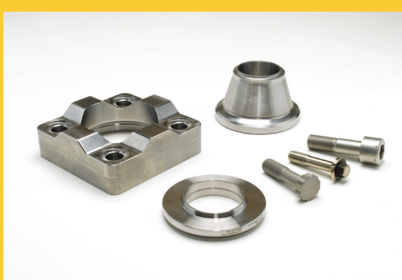
Feeder Connection Flange, Hub, Seal Ring & Bolts